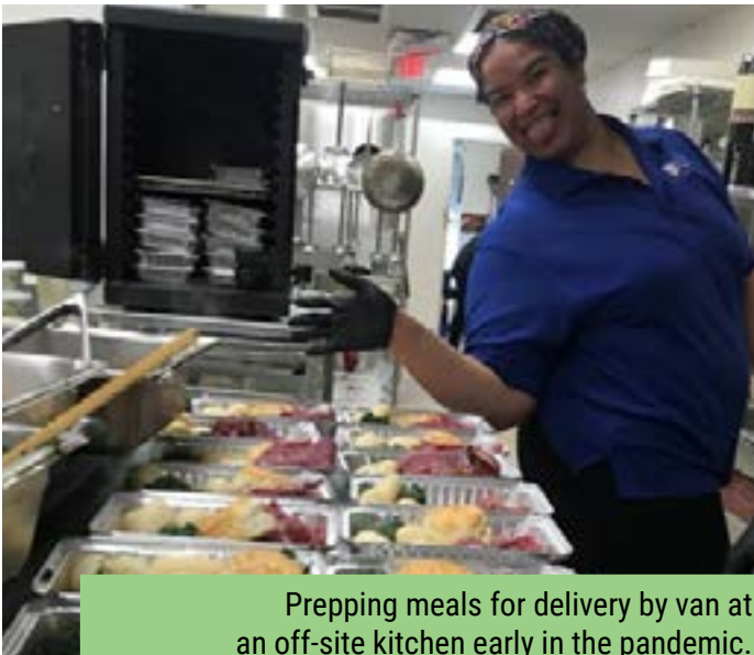
Prepping meals for delivery by van at an off-site kitchen early in the pandemic.

While we hope that we never experience another pandemic, we're a partner who's ready to weather the storm with you. Why? Because we know our ultimate responsibility is to the patients and residents we serve.