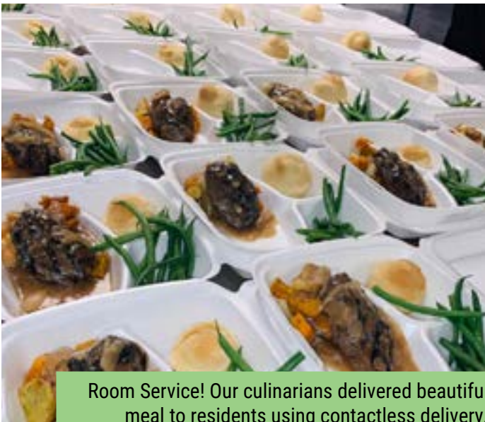
Room Service! Our culinarians delivered beautiful meal to residents using contactless delivery.